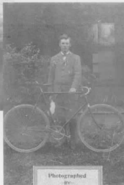
Convene, Maine.