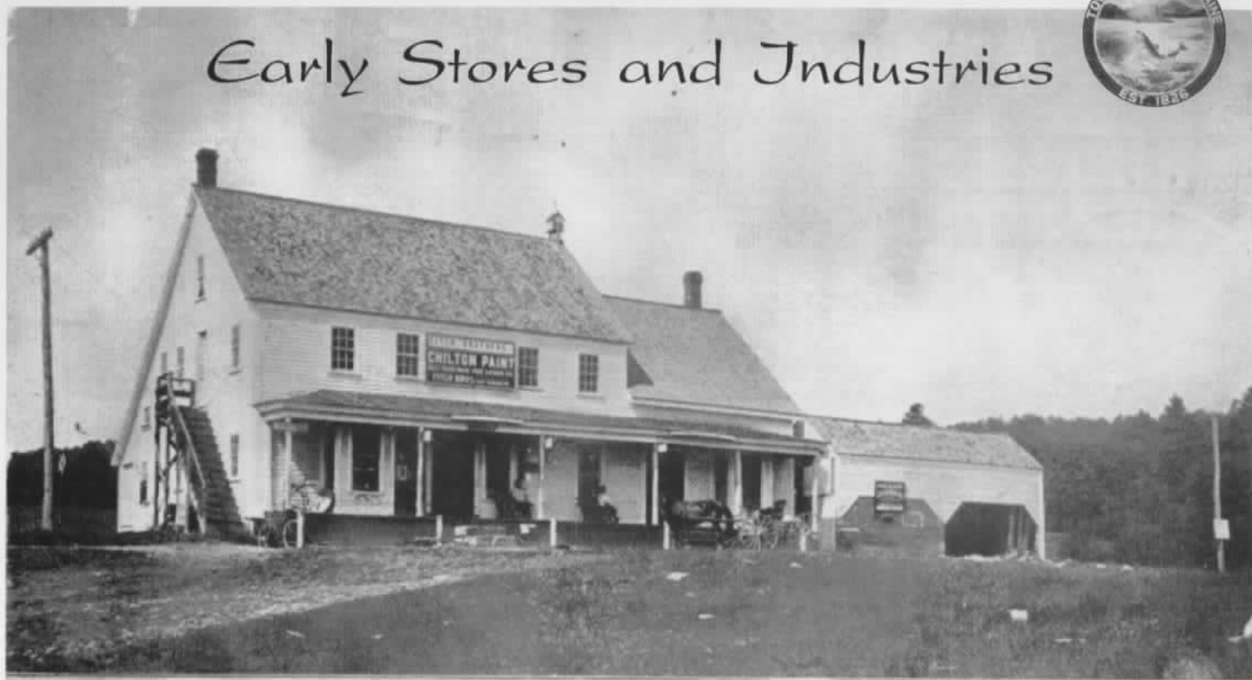
FITCH BROS. STORE, EAST SEBAGO, ME.