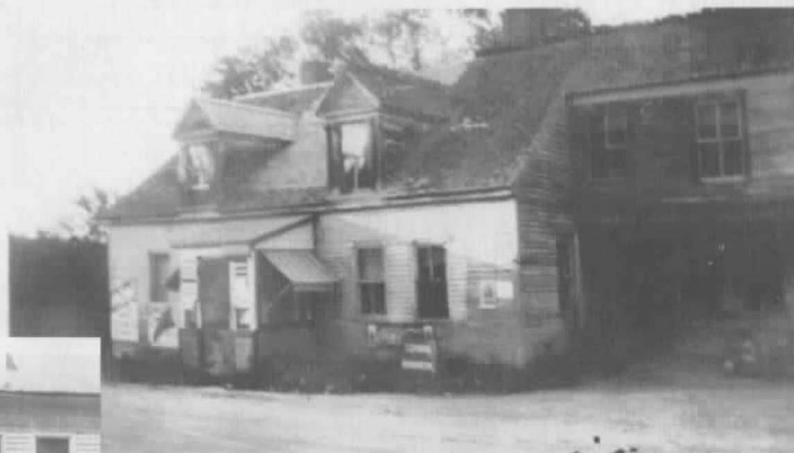
Stacy's - Mud City 1939