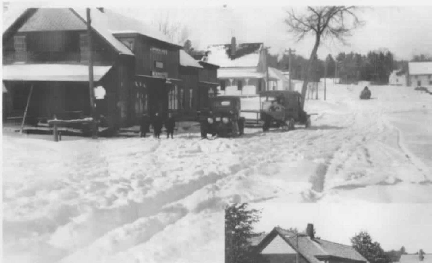
The LaGrove Sanborn Store by the brook in East Sebago was on the corner of Routes 114 and 11. Pictures were taken in the 1920's.