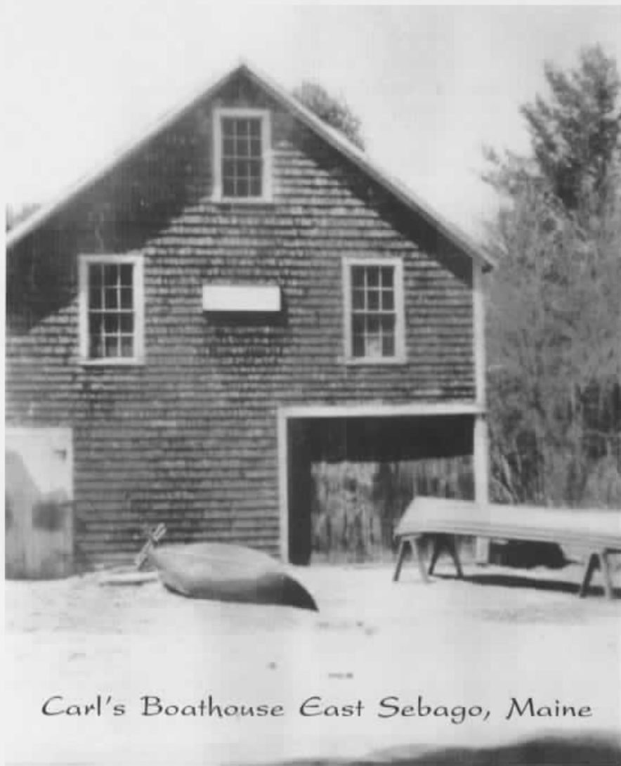
Carl's Boathouse East Sebago, Maine